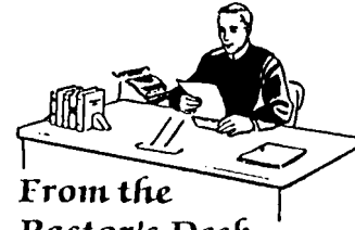
From the Pastor's Desk